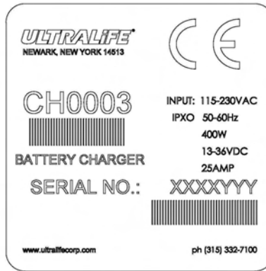
Figure 1: Name Plate