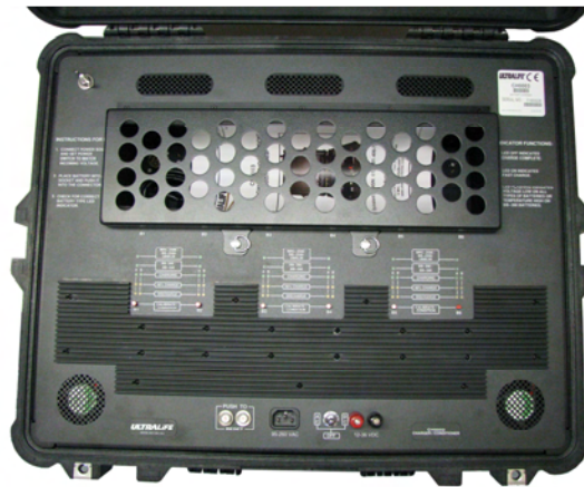
Figure 2: CH0003 Charger (Front View)

The CH0003 is 635mm (25") L x 508mm (20") W x 229mm (9") D and weighs approximately 15kg (33 lbs.) Figure 2 shows the physical layout of the charger. The CH0003 consists of six charge modules, an AC to DC Power Module and a Control/Filter Board.